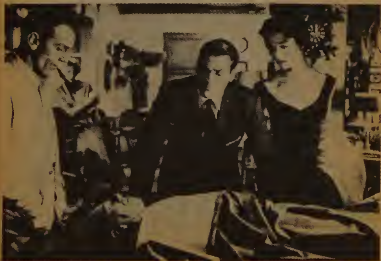
Invasion of the Body Snatchers (original version)

This piece of intelligence was greeted by absolute, tomblike silence. We just sat there, a theaterful of 1950s kids with crew cuts, whiffle cuts, ponytails, ducktails, crinolines, chinos, jeans with cuffs, Captain Midnight rings; kids who had just discov-