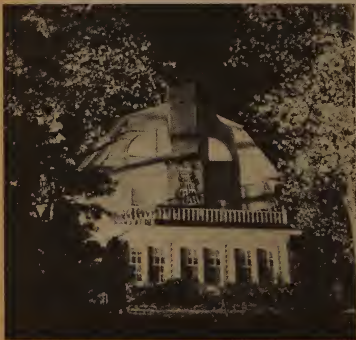
House of fear— The Amityville Horror