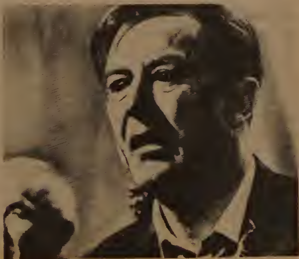
X— The Man with the X-Ray Eyes

In The Man with the X-Ray Eyes , Ray Milland plays a scientist who develops eyedrops which enable him to see through walls, clothing, playing-cards, you name it; a kind of super-Murine, if you will. But once the process begins, there is no slowing it down. Milland's eyes begin to undergo a physical change, first becoming thickly bloodshot and then taking on a queer yellow cast. It is at this point that we begin to feel rather nervous—perhaps we sense the gross-out coming, and in a very real sense it's already arrived. Our eyes are one of those vulnerable chinks in the armor, one of those places where we can be had. Imagine, for instance, jamming your thumb into someone's wide-open eye, feeling the squish, seeing it sorta squirt out at you. Nasty, right? Immoral to even consider such a thing. But surely you remember that time-honored Halloween party game Dead Man, where peeled grapes are passed from hand to hand to hand in the dark, to the solemn intonation of "These are the dead man's eyes"? Ulp, right? Yuck, right? Or as my kids say, Guh-ROSS!