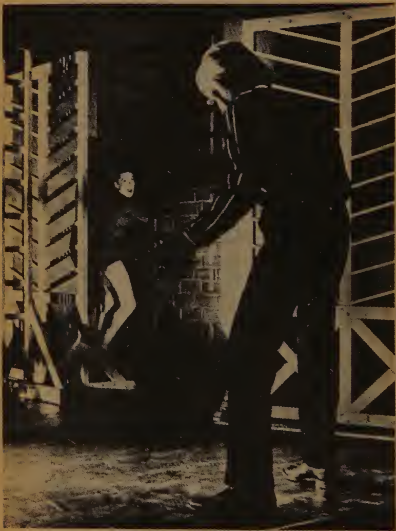
I Was A Teenage Werewolf