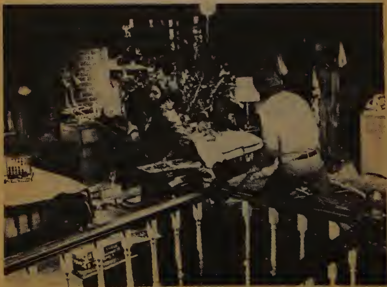
Invasion of the Body Snatchers (1978 version)