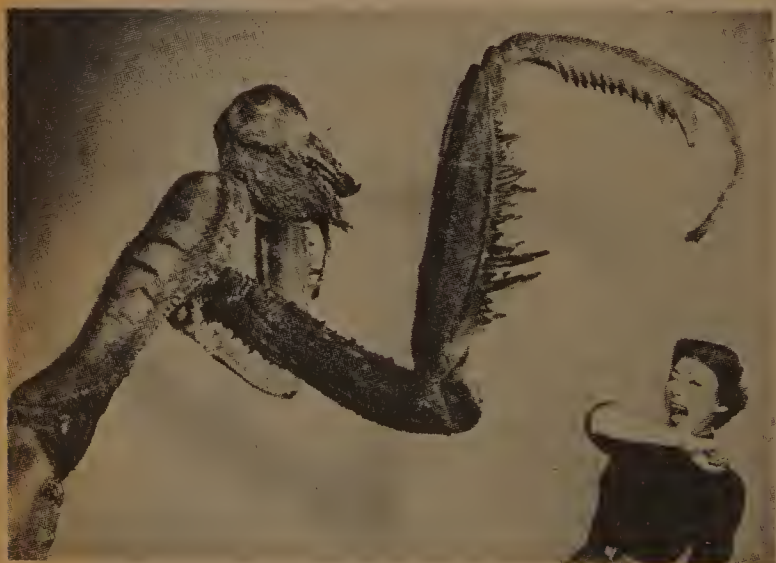
The Deadly Mantis

The mercury pollution causing all those monsters is pretty good, too—an updating of the old radiation-caused-these-Big-Bugs plot device. Then there's the fact that the monster gets all the bad guys. At one point she kills a little kid, but the kid, who is on a hiking trip with his parents, really deserves to go. He has brought along his suitcase radio and is Defiling the Wilderness with Rock 'N Roll. All that is missing from Prophecy (and its omission may have only been an oversight) is a sequence where the monster stomps the rotten old paper mill flat.