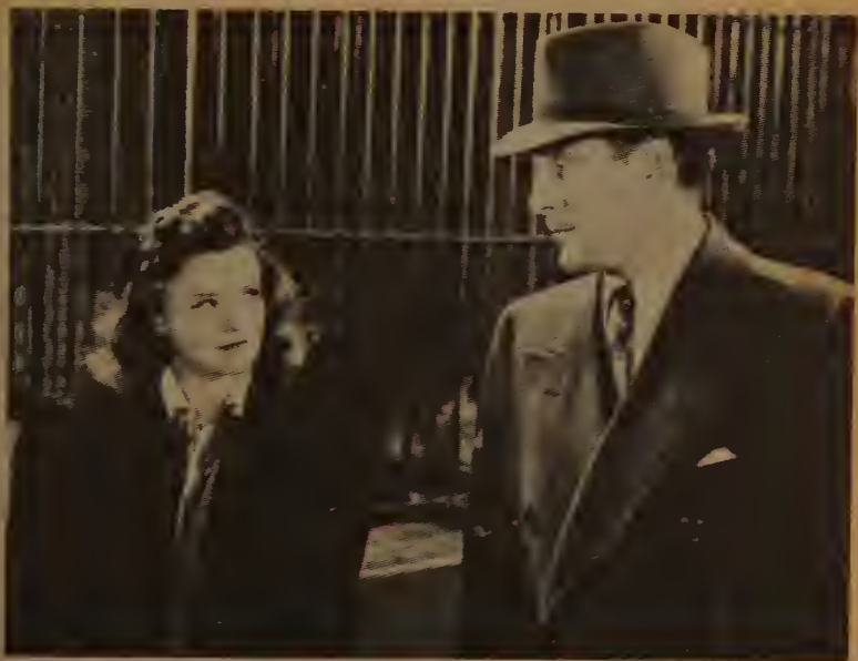
The Cat People

all, the film whispers to the audience, we know what these ivory-tower eggheads are like, don't we? Full of big ideas but not worth much in a situation calling for a practical man. Really, it says, when you get right down to it, those bigdome ideas make most scientists as responsible as a child with a box of matches. They may be great with their microscopes and telescopes, but it takes a man like Kenneth Tobey to understand about America's Vigilant and Unceasing Etc., Etc., Etc.