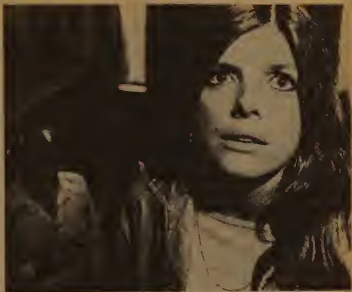
The Stepford Wives

must..." The secret of Stepford comes clear immediately. Freud, in a tone which sounds suspiciously like despair, asked: "Woman... what does she want?" Forbes and company ask the opposite question, and come up with a stinging answer. Men, the film says, do not want women; they want robots with sex organs.