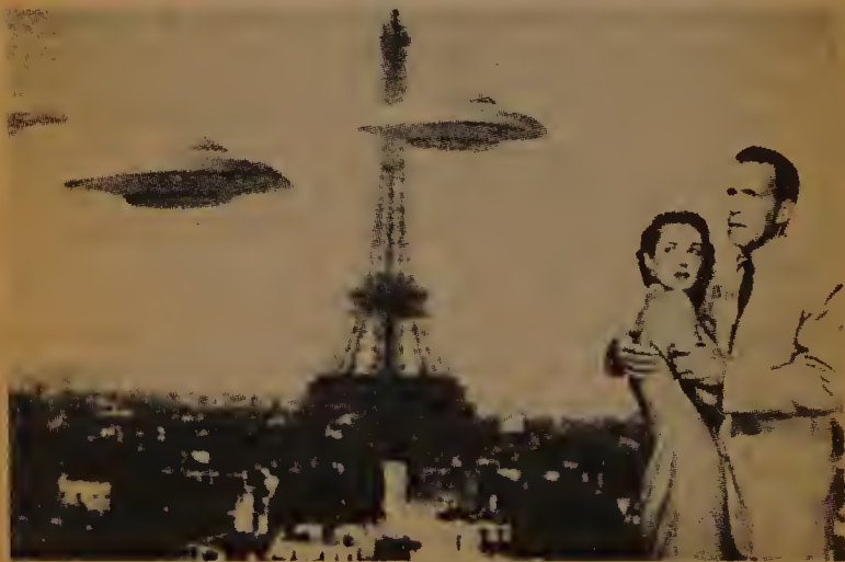
Earth vs. the Flying Saucers

Klaatu comes to extend the hand of friendship and brotherhood. He offers the people of Earth membership in a kind of