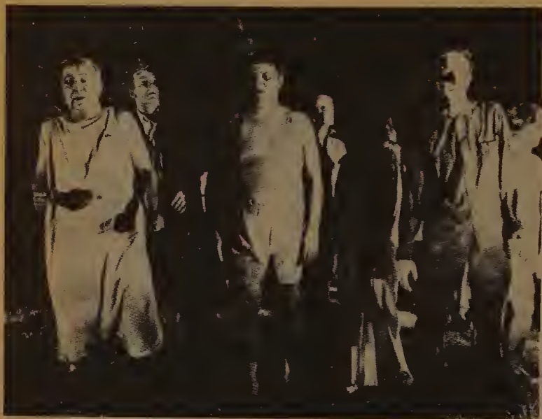
Night of the Living Dead

folks getting up and walking; it happened because a space probe to Venus picked up some weird corpse-reviving radiation on its way back home. One suspects that chunks of such a satellite would be eagerly sought-after artifacts in Palm Springs and Fort Lauderdale.