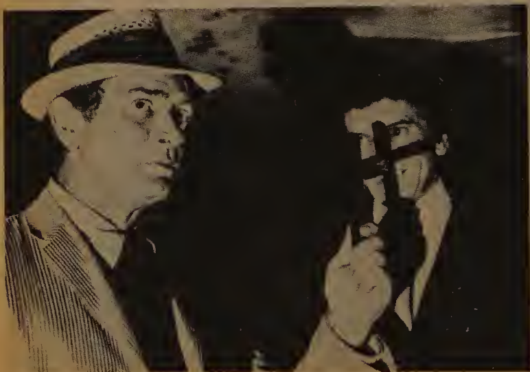
Kolchak: The Night Stalker

But the basic problem with the Night Stalker series was the problem which dogs any nonanthology series dealing with the supernatural or the occult: a complete breakdown in the ability to suspend disbelief. We could believe Kolchak once, as he tracked the vampire down in Vegas; with some added effort we could even believe in him twice, tracking down the undead