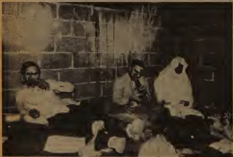
Dawn of the Dead

It is also undeniable that filmmakers seem to return again and again to these three great monsters, and I think that in large part it's because they really are archetypes; which is to say, clay that can be easily molded in the hands of clever children, which is exactly what so many of the filmmakers who work in the genre seem to be.