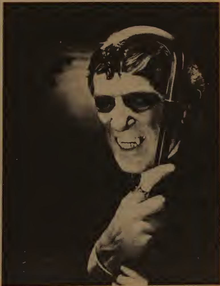
Barnabas Collins (Jonathan Frid) in Dark Shadows

Dan Curtis went on to make two theatrical films based on the Dark Shadows plot and using its cast of undead characters—such a jump from TV to the movies is not unheard-of ( The Lone Ranger is a case where it also happened), but it's rare,