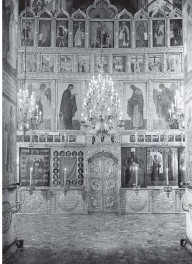
3. An iconostasis in the Moscow Kremlin