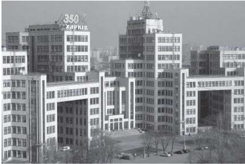
12. A contrast in architectural styles: (a) the constructivist Kharkov Palace of Industry