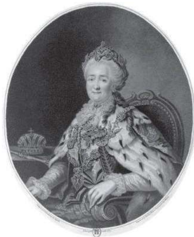
6. A contemporary portrait of Catherine the Great

In the event, she was disappointed. The proposals of the various estates displayed a predominant concern with their own narrowly conceived interests, rather than with the needs of the state or the population as a whole. It was difficult to fashion a new Law Code out of them, and at the outbreak of the Turkish war in 1768 Catherine prorogued the sessions. She never reconvened the Commission, but did use its materials in further lawmaking. She correctly discerned that Russia's greatest need was for 'intermediate' institutions between the state and the population. She tried to provide for them by creating new local government institutions, provinces ( gubernii ) and districts ( uezdy ), in which the nobility would play the main role. Peter III had already freed the nobility from the obligation to perform state service. She went further: her Charter to the Nobility (1785) guaranteed its property, freed it from corporal punishment, and allowed it to set up its own assemblies in each guberniia and uezd , with power to appoint local officials.