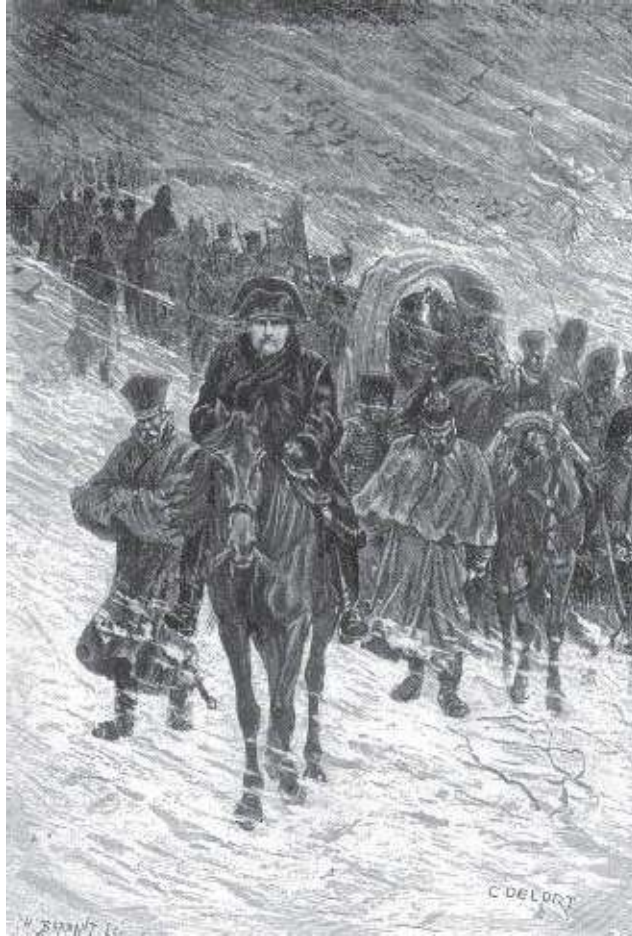
7. A woodcut of Napoleon's winter retreat from Moscow