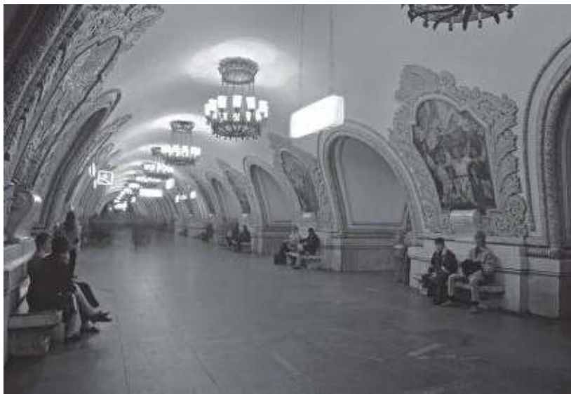
(b) the neo-Baroque Kievskaiia Metro station