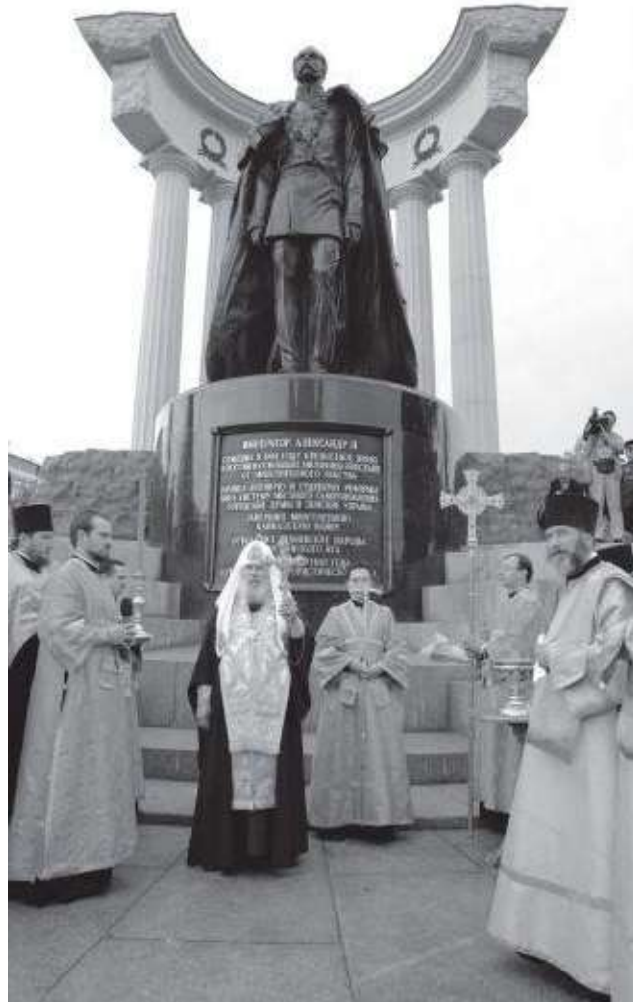
9. Patriarch Alexii sanctifies the monument to Tsar Alexander II, erected only after the fall of the Soviet Union