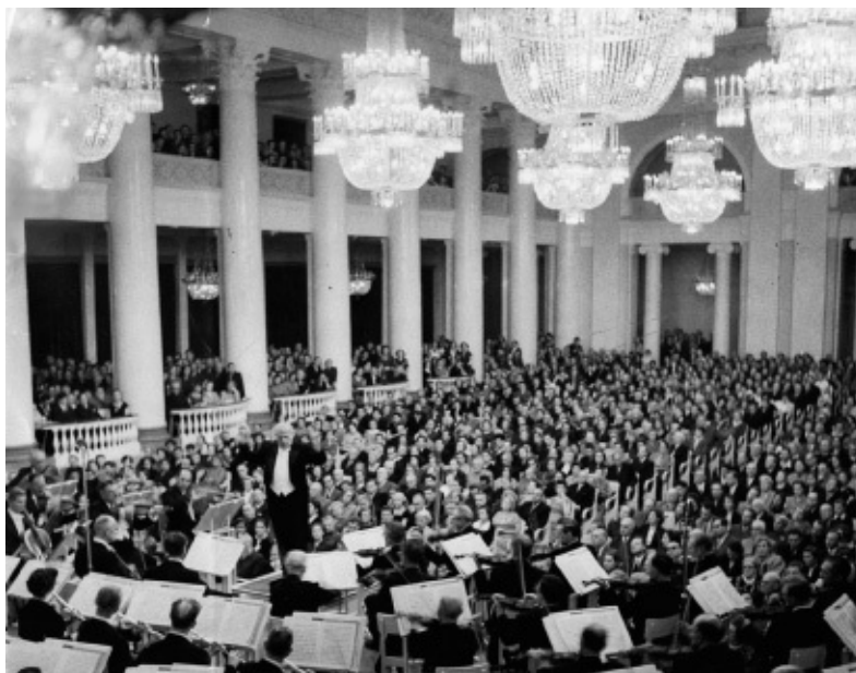
9. Charles Munch conducts the Boston Symphony Orchestra in Leningrad, September 6, 1956.

The musical elite were all there: Shostakovich, Kabalevsky, Khachaturian, the Oistrakhs, Kiril Kondrashin, the young Rostropovich. Russian players met their Boston counterparts backstage. Vladimir Ashkenazy remembers the Boston visit as the high point of his conservatory studies; Kurt Sanderling, Mravinsky’s longtime associate conductor, soon left Russia to pursue an international career. A Russian violinist who later went to the San Francisco Symphony was impressed that the Bostonians, players and their conductor alike, arrived at rehearsal wearing open shirts and slacks, tuning and conversing onstage. In the aftermath President Eisenhower saluted the orchestra for demonstrating “one of the most effective methods of strengthening world friendship.” And it was true that the Iron Curtain had been rent: the following season, leading Russian orchestral composers arrived in the United States, and the season after that Van Cliburn won the first International Tchaikovsky Music Competition in Moscow.