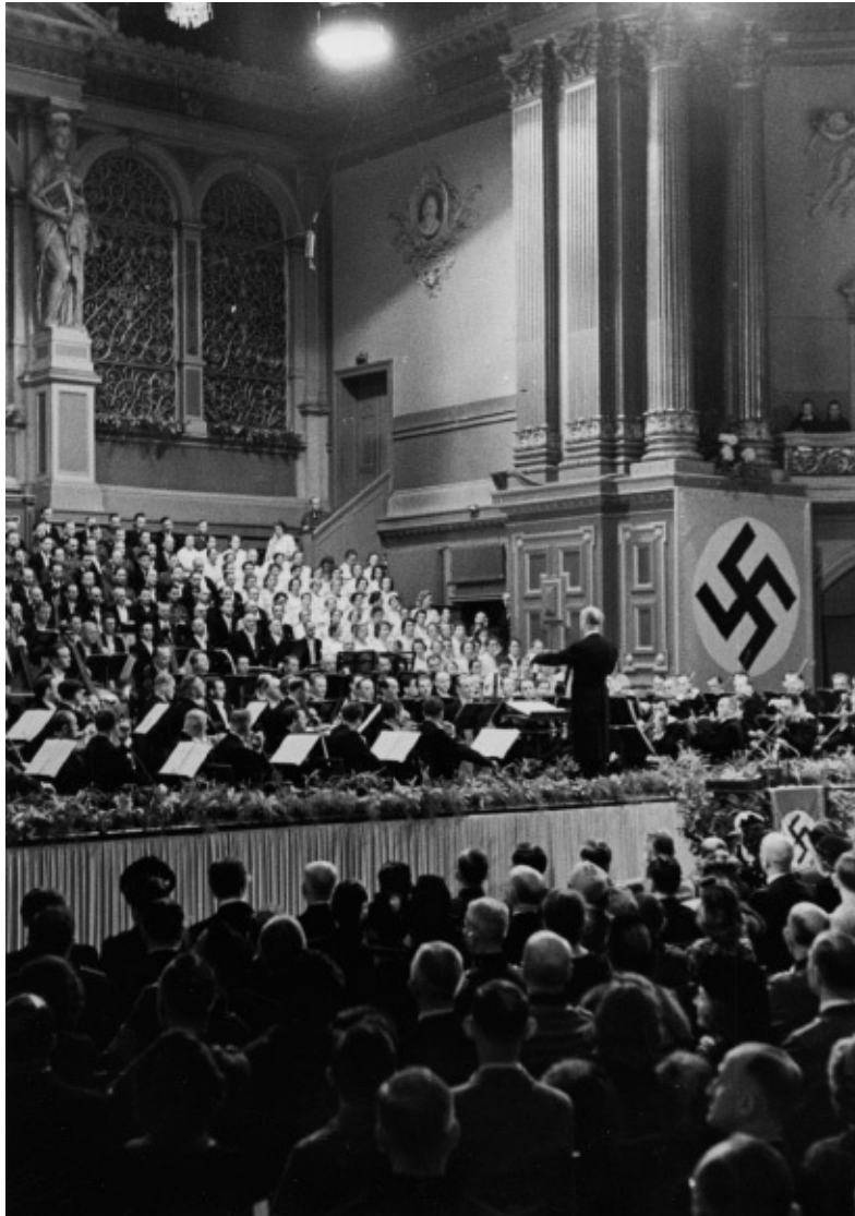
8. Wilhelm Furtwängler conducts the Berlin Philharmonic in Beethoven's Ninth Symphony for Hitler's birthday, April 19, 1942.