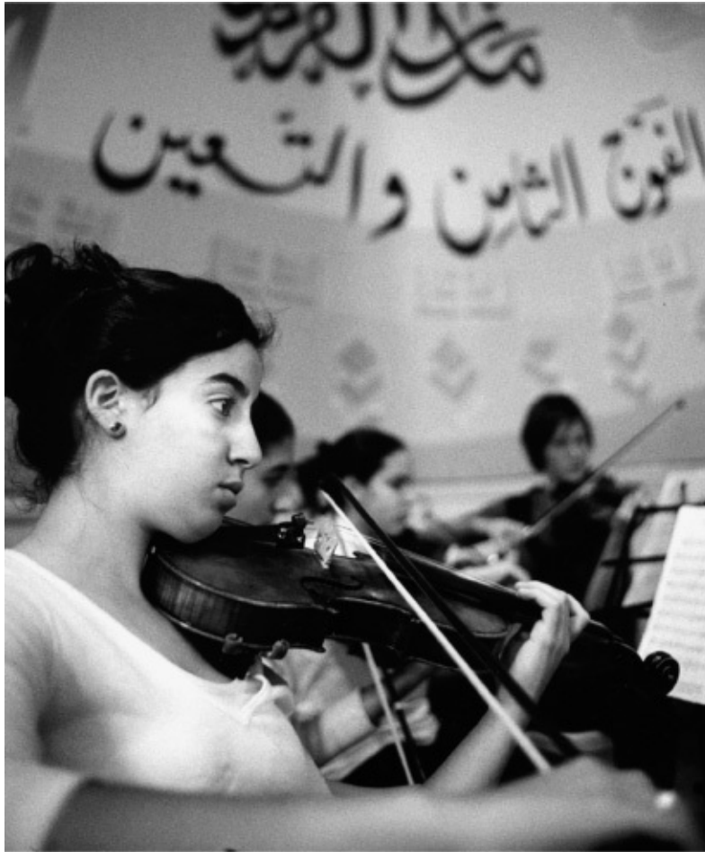
10. The concertmaster of the West-Eastern Divan Orchestra warms up before a concert in Ramallah, 1999.