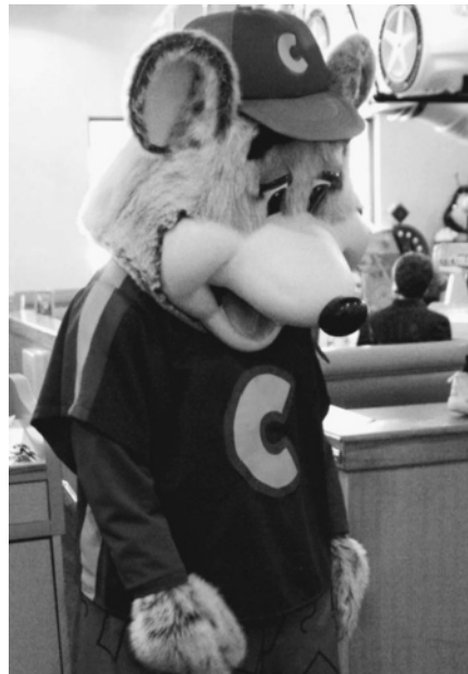
Chuck E. Cheese mascot.

SUGGESTED READING: Philip Langdon, Orange Roofs, Golden Arches: The Architecture of American Chain Restaurants (New York: Knopf, 1986); Chuck E. Cheese Web site: www.chuckecheese.com