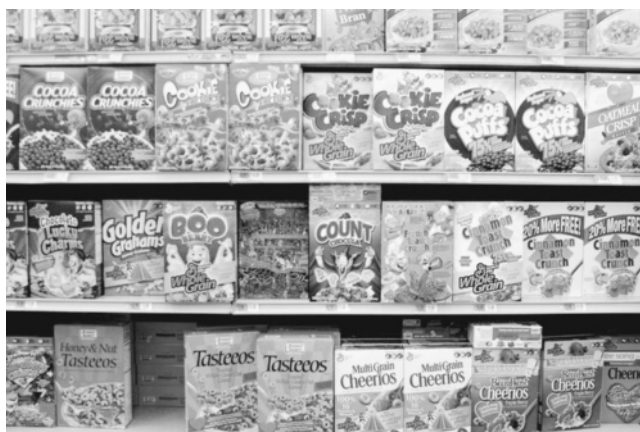
Some of the cereal choices at the American supermarket.

In 1863, Dr. James C. Jackson, a vegetarian who operated the Dansville Sanitarium in Dansville, New York, advocated eating healthy food. He took graham flour, baked it, and broke it up into small pieces. This was the first breakfast cereal, and he called it granula. One of the patrons of Jackson's spa was Ellen White, who later formed the Seventh-Day Adventist church. The Seventh-Day Adventists launched a health asylum of their own in Battle Creek, Michigan. In 1876, John Harvey Kellogg became its director. Kellogg visited Jackson's spa and liked granula. Upon his return, Kellogg duplicated Jackson's formula and began selling it. Evidently Jackson threatened to sue him, so Kellogg changed the formula and called his new product granola.