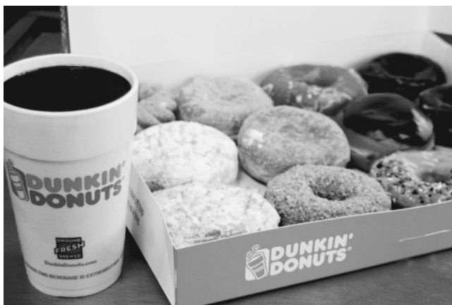
Dunkin' Donuts.