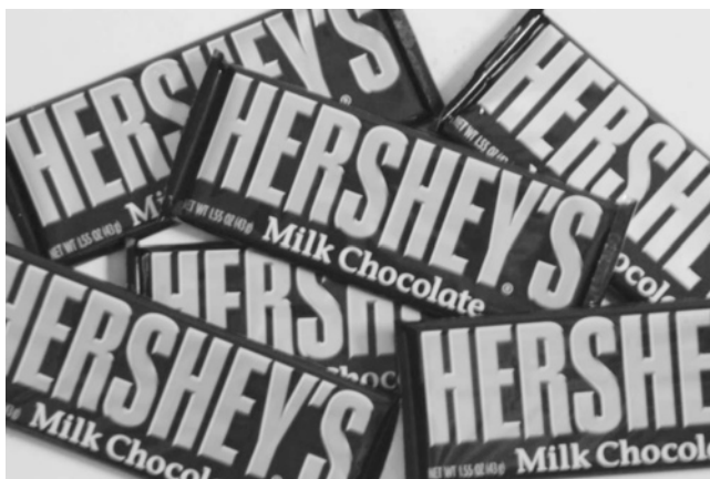
Hershey's bars.