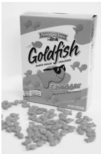
Goldfish.