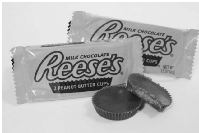
Reese's peanut butter cups.