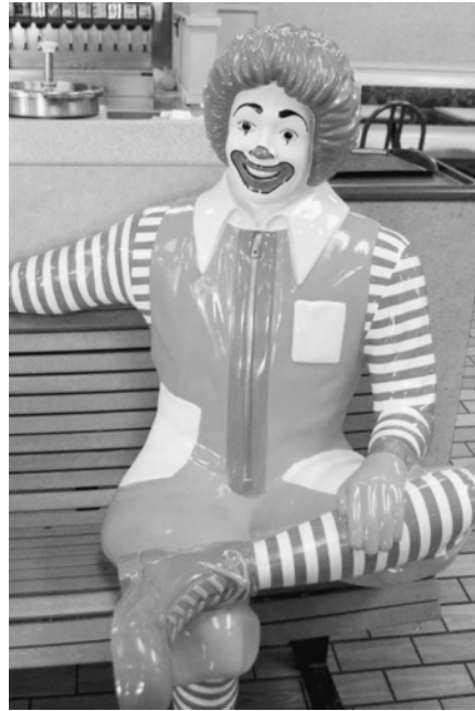
Ronald McDonald. © Kelly Fitzsimmons

The term was picked up and popularized in academic circles by George Ritzer, whose book The McDonaldization of Society (1993) examined the social effects of McDonald's in the United States. McDonald's rigorously controlled the appearance of each of its outlets, as well as their menus, equipment, procedures, advertising, suppliers , and policies. McDonald's success had launched many imitators, not only in fast food industry but also throughout America's retail economy. Ritzer defined McDonaldization as "the principles by which the fast-food restaurant[s] are coming to dominate more and more sectors of