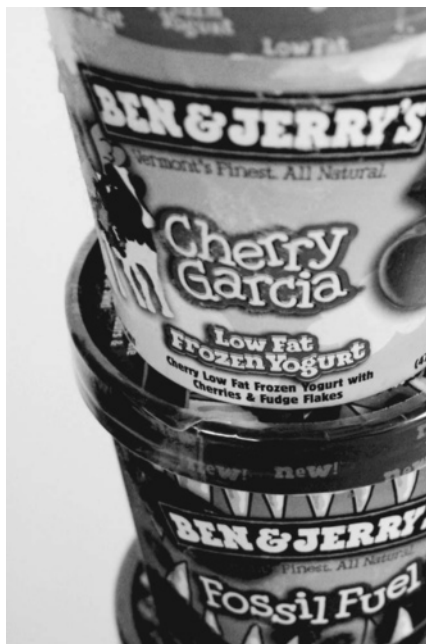
Ben & Jerry's ice cream.

Ben & Jerry's became known for its innovative flavors and strange names, such as Cherry Garcia (named after rock star Jerry Garcia). At a time when mix-ins were innovative in ice cream making, Ben & Jerry's mixed chunks of nuts and fruit into their ice cream. The company was also popular for its use of natural ingredients and its eco-friendliness. Its ice cream cartons were made from recycled paper, and farmers who supplied dairy products to the company pledged that the latter were free of bovine growth hormone (BGH).