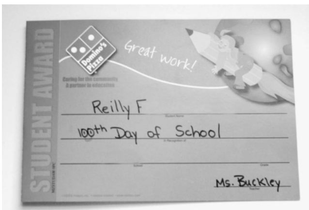
Domino's-sponsored school award.

The schools argue that they need the money. Some schools generate tens of thousands of dollars through corporate sponsorships and sales