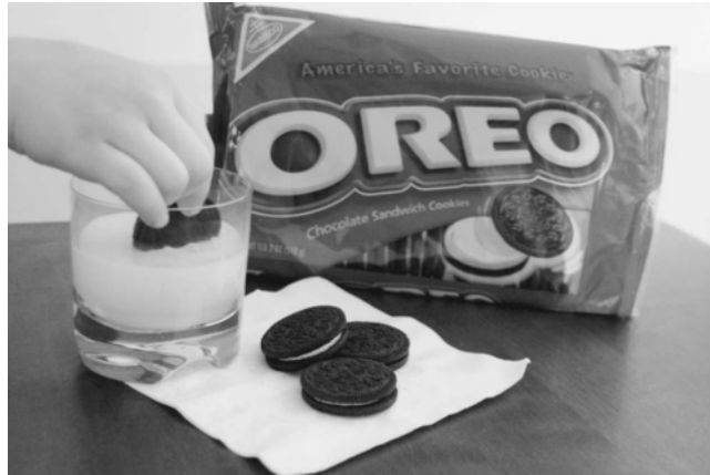
Oreos.