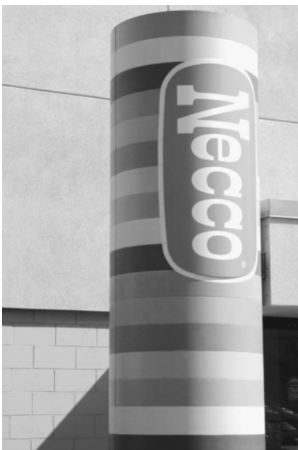
NECCO landmark.

SUGGESTED READING: Nestlé Web site: www.nestle.com ; Friedhelm Schwarz (Maya Anyas, trans.), Nestlé: The Secrets of Food, Trust, and Globalization (Toronto: Key Porter Books, 2002).