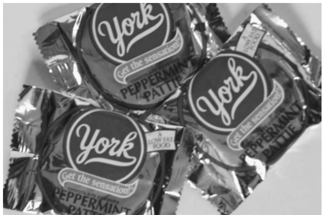
York Peppermint Patties.

York Peppermint Patties The York Peppermint Pattie is a flat, round, dark chocolate with peppermint creme inside. It was formulated and launched in 1940 by the York Cone Company, which mainly manufactured ice cream cones. The company had been founded in 1920 in York, Pennsylvania; it mainly distributed its product in the Northeast, Ohio, Indiana, and Florida. In 1972, the company was acquired by Peter Paul , which expanded production and aggressively promoted it nationally beginning in 1975. Peter Paul was sold to Cadbury in 1978 and, 10 years later, the Hershey Company acquired York Peppermint Patties when it purchased the confectionery operations of Cadbury Schweppes in the United States. It is one of the best-selling candies in the United States.