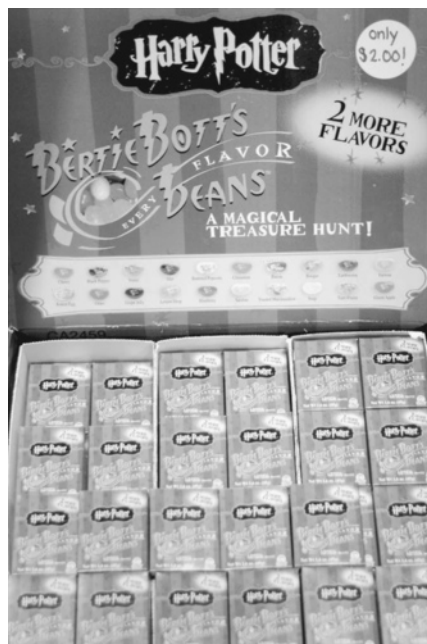
Gross-out flavors including dirt, earwax, and rotten egg.