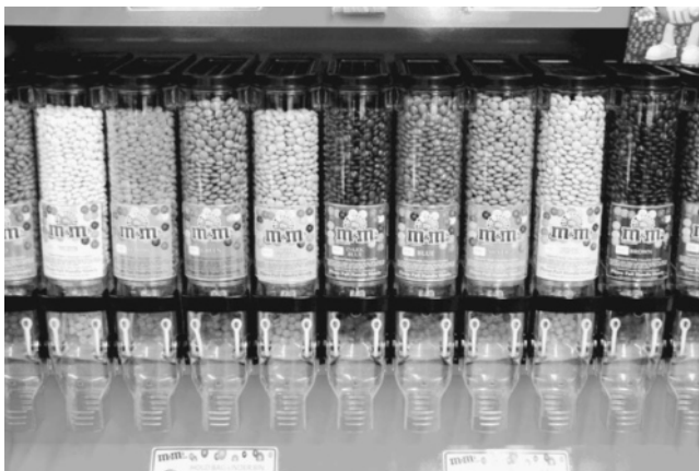
M&M's.

the red candies to avoid consumer misperception. Ten years passed before Mars reintroduced red M&M's.