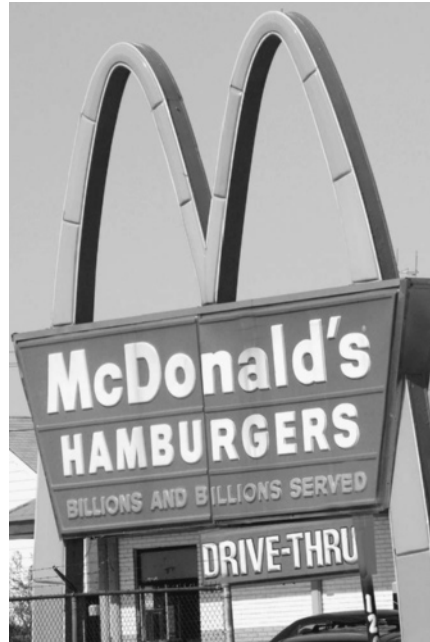
The golden arches.

Slogans and Jingles In the junk food and fast food world, slogans are usually short, striking phrases intended to encourage consumers to purchase products. Typically, slogans are used repeatedly in advertising . Soda manufacturers have used slogans since the late nineteenth century. Dr Pepper used “King of Beverages” and, more recently, “Be a Pepper!” Mountain Dew used the slogan “Get That Barefoot Feelin’ Drinkin’ Mountain Dew.” Pepsi-Cola and Coca-Cola have had some of the most memorable slogans. Coca-Cola’s slogans include “The Pause that Refreshes,” “It’s the Real Thing,” “I’d Like to Buy the World a Coke,” “Coke Is It,” and “Things Go Better with Coke.” Pepsi has countered with just as memorable slogans, such as “Come Alive! You’re In the Pepsi Generation,” and “Pepsi-Cola Hits the Spot,” which Advertising Age rated as one of the most successful advertising campaigns of the twentieth century.