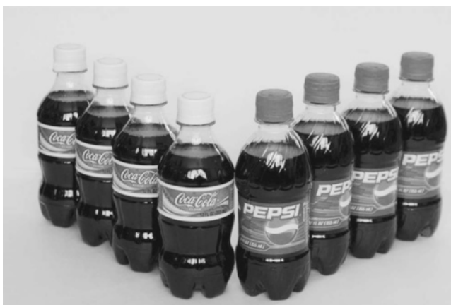
Coke vs. Pepsi.