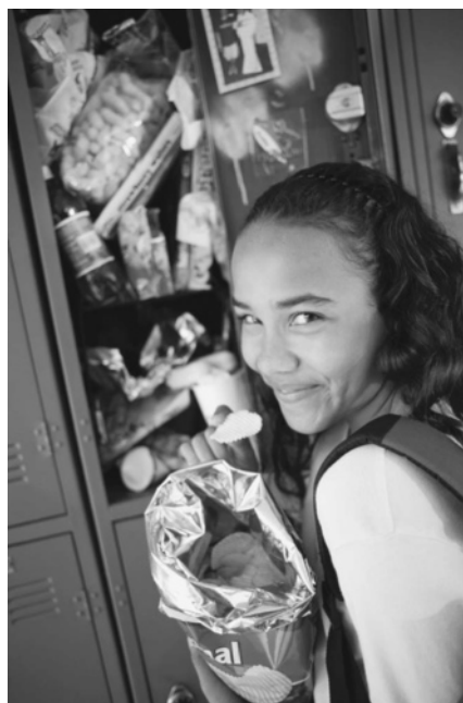
Potato chips in the school locker.

SUGGESTED READING: Michael Turback, Hot Chocolate (Berkeley, CA: Ten Speed Press, 2005); Tang Web site: www.kraft.com/archives/brands/brands_tang.html