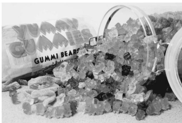
Gummi bears.