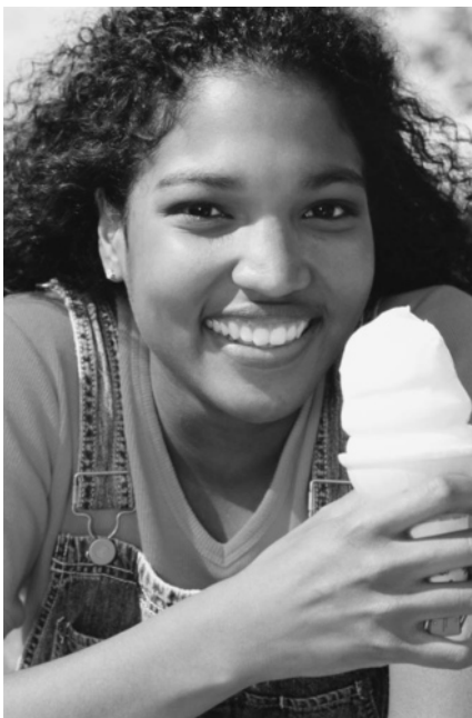
Soft serve.

for much of this increase as soda fountains thrived in the 1920s. By 1925, 30 percent of the country's ice cream was sold in soda fountains.