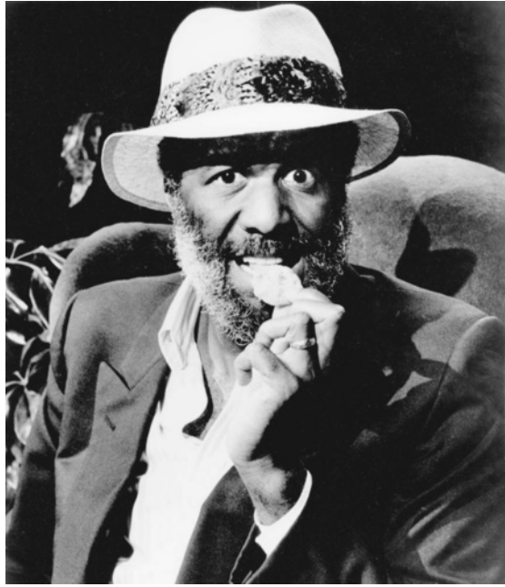
Wally Amos, of Famous Amos Cookies.

Famous Amos In 1975, Wally Amos, a talent agent with the William Morris Agency, opened the Amos Chocolate Cookie Company on Hollywood's Sunset Boulevard, Los Angeles. He called his brand Famous Amos and his store was the nation's first gourmet chocolate chip cookie store. The recipe for his chocolate chip cookie was a variation of Nestlé's toll house cookie, but Amos had plenty of big-name contacts from his talent agency days who helped him promote his store and his products. Bloomingdale's, the department store, began selling his cookies and the New York Times published an article about them in 1975.