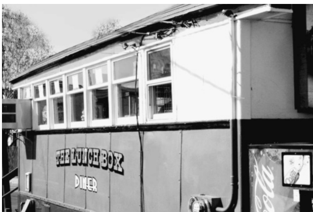
A diner in Pennsylvania.