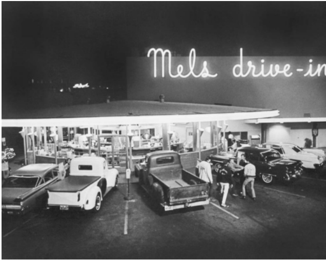
Mels drive-in from American Graffiti (1973), directed by George Lucas.

and walkways. Theater operators were not interested in having their expensive carpets soiled by spilled popped kernels, soda pop, and other confections. The cost of cleaning up popcorn, gum, candy wrappers, and soda containers was not worth the income generated by the sale of junk food.