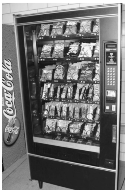
Vending machine. © Kelly Fitzsimmons

Vending machines became controversial when they were placed on public school campuses. In 2006, Faerie Films released a documentary film titled Vending Machine , which examined health issues as seen from the viewpoint of teenagers who have been targeted by fast food and junk food manufacturers. Efforts are underway to remove vending machines selling soda and junk foods from schools.