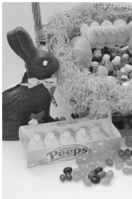
Easter candy.

According to the National Confectioners Association , which has strongly supported the tradition of giving candy at holidays, Easter is second only to Halloween as the most important candy-consuming holiday in America. Annually, Americans purchase almost $2 billion in Easter candies, including 90 million chocolate Easter bunnies, 16 billion jelly beans, and 700 million marshmallow Peeps.