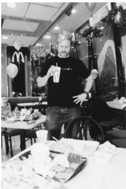
Filmmaker Morgan Spurlock after a McDonald's meal, from his 2004 documentary Super Size Me.

Obesity and fast food became linked and super-sized became a symbol of this relationship. The filmmaker Morgan Spurlock filmed his experiences eating three meals a day from McDonald's (supersized if offered) for 30 days and documented the effects on his body. According to the film, Spurlock gained 30 pounds and reported serious health problems at the end of the 30 days. The release of the film, Super Size Me (2004), generated bad publicity for McDonald's throughout the world. Prior to its release, McDonald's phased out supersizes from its meal options. Spurlock's film was nominated for a Oscar for Best Feature Documentary. He subsequently wrote a book, Don't Eat This Book: Fast Food and the Supersizing of America (2005), describing his experiences while making the movie and criticizing fast food restaurants and the food they serve.