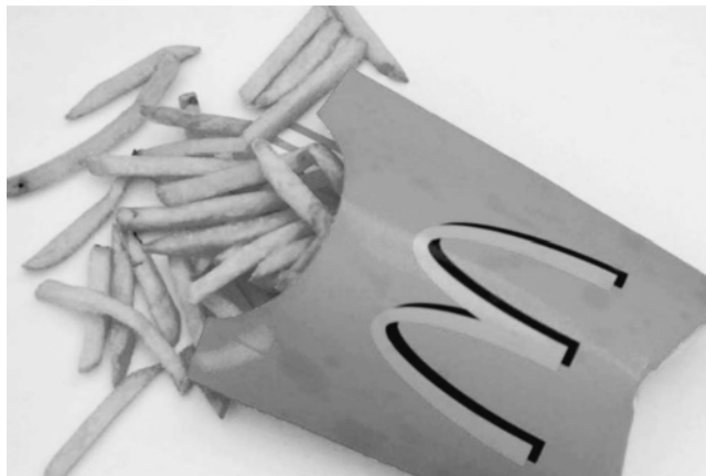
McDonald's French fries.

By the early twentieth century, French fries were occasionally served in cafés, diners, roadside eateries, and fast food outlets. Their advantage was that they