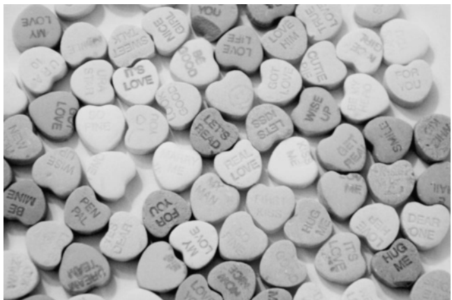
Classic Valentine's Day candy.

Vegetarianism/Veganism The term vegetarian was used in the United States by the 1830s, but it was popularized by Vegetarian Society of the United Kingdom at their first meeting in 1847 and by the American Vegetarian Society at its inaugural meeting in 1850. During the latter part of the nineteenth century, the Seventh-Day