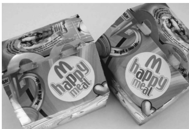
Happy Meal containers.

Happy Meal In 1973, Burger Chef, a small, regional hamburger chain , began offering a kids' meal promotion. The kids' meal was a success but the chain failed. The success of Burger Chef's kids' meal encouraged McDonald's to launch its brightly colored Happy Meals in 1978. It offered kid-sized portions, along with toys. As these children matured and continued to frequent McDonald's long after they stopped buying Happy Meals, McDonald's learned the importance of gaining brand loyalty