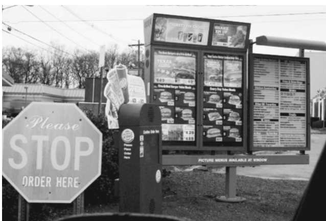
Drive-thru menu.

of the reasons for this phenomenal success. Drive-thru windows had many advantages, including the fact that Wendy's saved on space in its parking lots and indoor eating areas, as drive-thru customers normally drove off and ate their order elsewhere. Other chains saw Wendy's success and immediately began tearing down walls to construct drive-thru windows in their outlets. Tests demonstrated that drive-thru windows actually increased sales. By 1976, most national fast food chains had drive-thru windows. Some constructed double