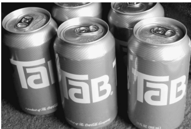
Tab cola.

he decided to develop a sugar-free soft drink for the institution's diabetic and cardiovascular patients. Using the artificial sweetener calcium cyclamate, he created the first diet beverage. In 1952, Kirsch Beverages began marketing No-Cal (no calorie) ginger ale and root beer . Their sales were moderate but the idea encouraged others to produce diet beverages.