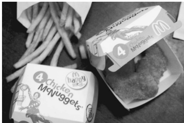
Chicken McNuggets.

The original McNuggets contained ground chicken skin in addition to chicken meat and were fried in oil. When the McNuggets were tested by McDonald’s technicians, six of the McNuggets had