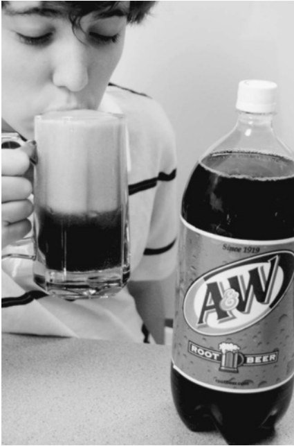
A&W Root Beer.

Arizona. The product was well-received and was subsequently distributed nationally, along with sugar-free, low-sodium, and caffeine-free versions. In 1974 the company introduced its mascot , The Great Root Bear.