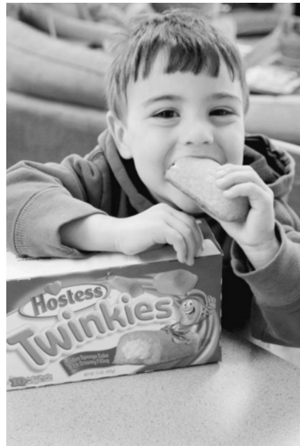
Twinkies.

Twinkies became a cultural icon. They have inspired a cartoon character (Twinkie the Kid) and have appeared in many movies, such as Ghostbusters (1984), Grease (1978), and Sleepless in Seattle (1993). Perhaps the most unusual cultural connection was with the so-called Twinkie Defense. At the 1979 trial of Daniel White, who admitted to the murders of San Francisco mayor George Moscone and supervisor Harvey Milk, White claimed that he should be absolved of his crime because of impaired mental capacity resulting from compulsive eating of too much junk food , such as Twinkies, candy bars, cupcakes, and Cokes, which caused a chemical imbalance in his brain. White said he therefore murdered because of his abnormally high blood sugar . Although this was a novel defense, White was still convicted. In 1981, Congress outlawed the Twinkie Defense. While many people are convinced that children's behavior is influenced by the large amounts of sweets they consume, little scholarly proof has been offered for this assertion.