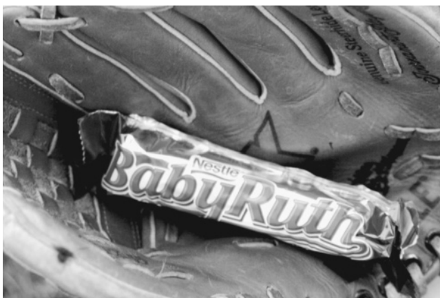
Baby Ruth candy bar.

become the best-selling five-cent confection in America. This position was solidified in 1929, when Curtiss began sponsoring the CBS radio program The Baby Ruth Hour .