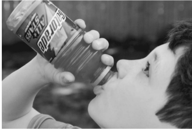
Gatorade.

the beverage prevents heat stress and heat stroke during heavy workouts. Gatorade was used by the University of Florida football team in 1967, when the team won the Orange Bowl title. This gave the drink extensive national visibility and Gatorade began to be manufactured and sold in stores. Since 1986, barrels filled with Gatorade and ice have traditionally been emptied over the heads of coaches after wins.