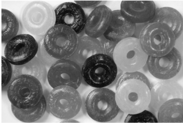
LifeSavers.