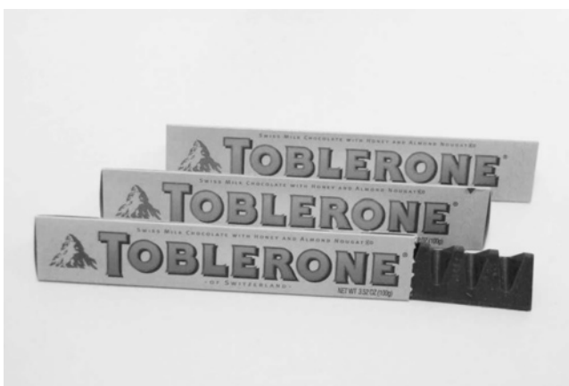
Toblerone bars.

SUGGESTED READING: Eric Schlosser, Fast Food Nation: The Dark Side of the All-American Meal (New York: Houghton Mifflin Company, 2001).