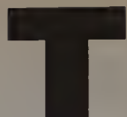
tableau [tab-loh] (plural -leaux or -leaus), a 'picture' formed by living persons caught in static attitudes. Tableaux were sometimes used at the ends of *acts in 19th-century *melodrama and *farce. The parlour-game of tableaux vivants ('living pictures'), in which living people adopt the postures of characters in a famous painting, was also a popular diversion in the 19th century, and is sometimes found in modern *pageants. In a story or poem, a description of some group of people in more or less static postures is sometimes called a tableau.