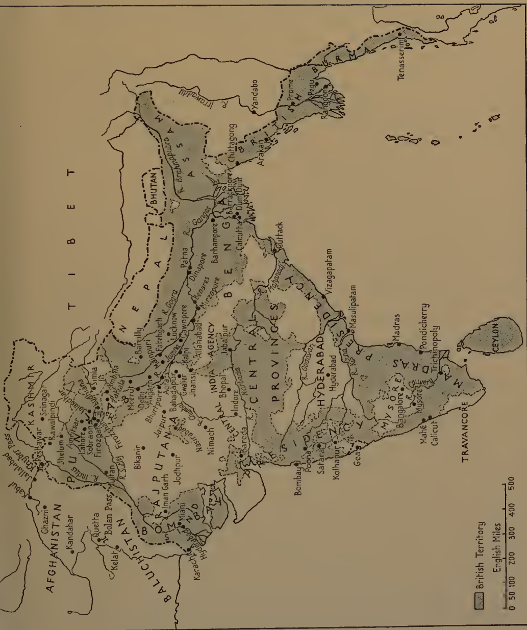
6. INDIA, 1857