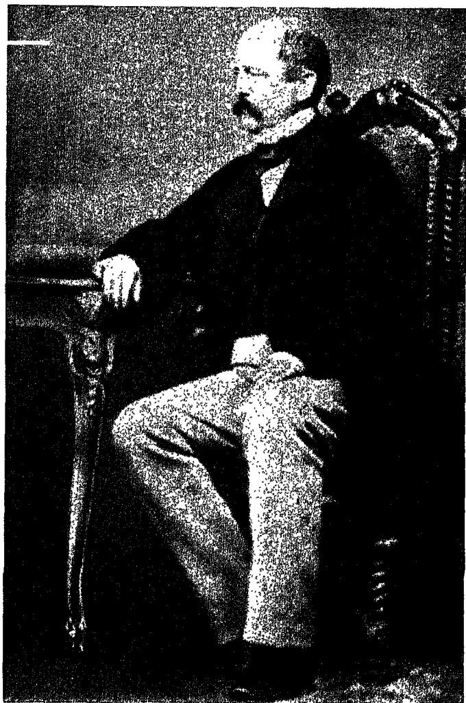
BISMARCK IN 1865