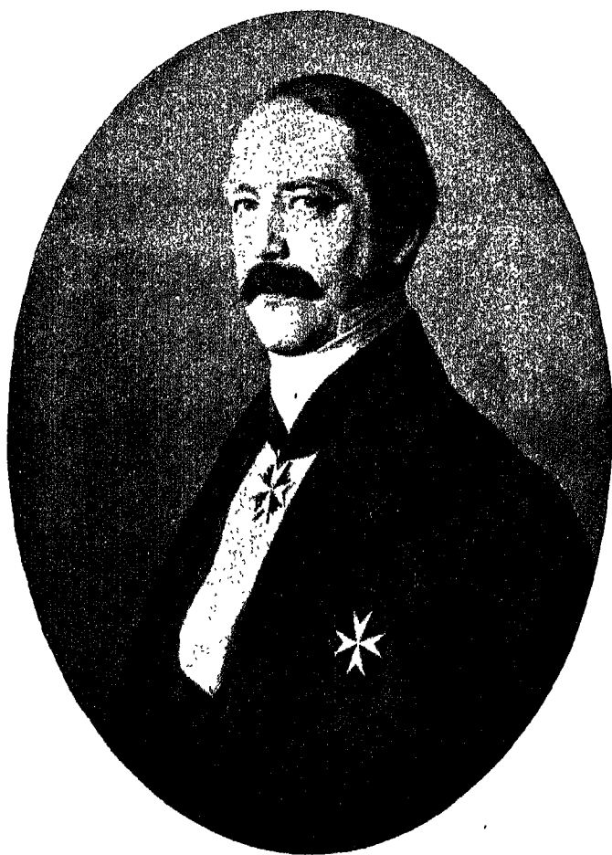
BISMARCK IN 1855