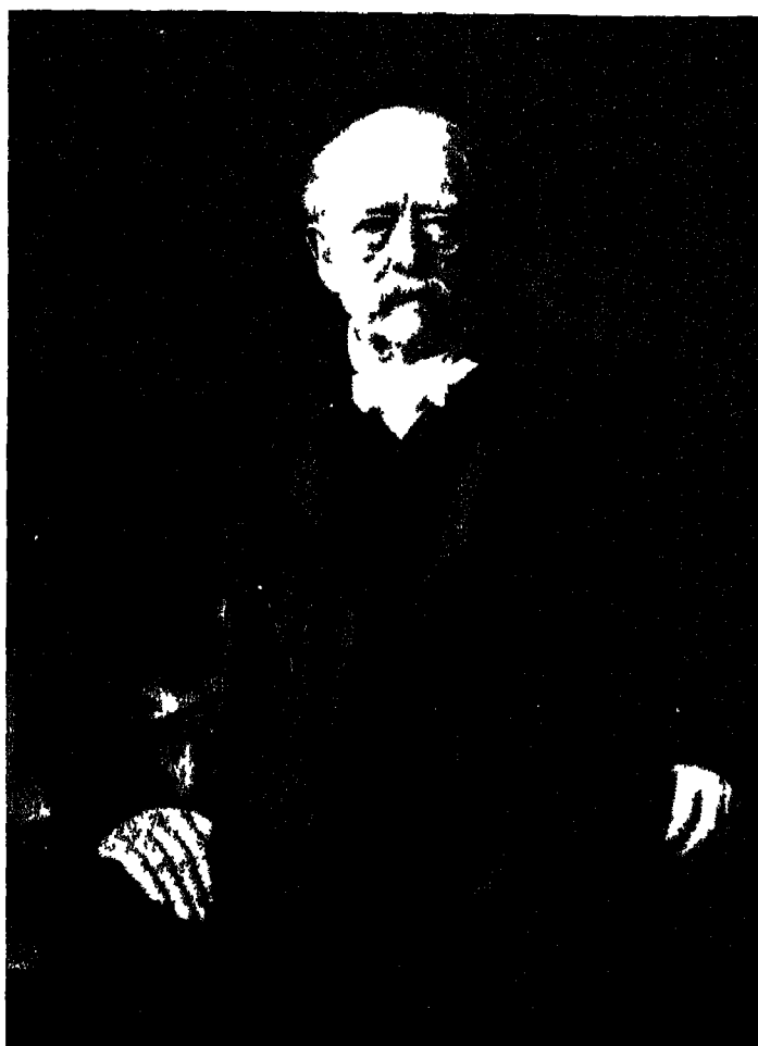
BISMARCK IN 1895