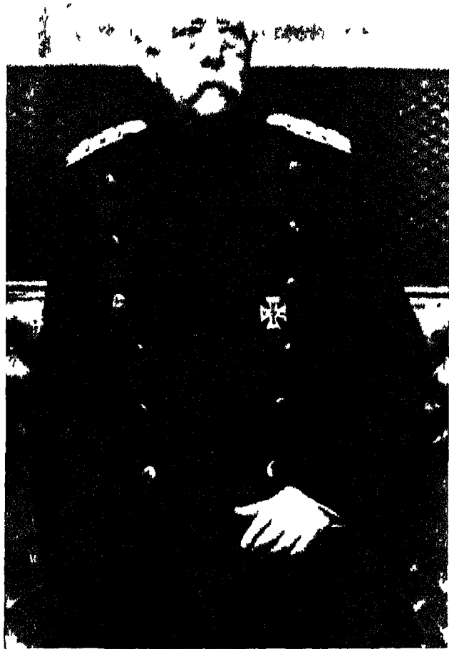
BISMARCK IN 1889