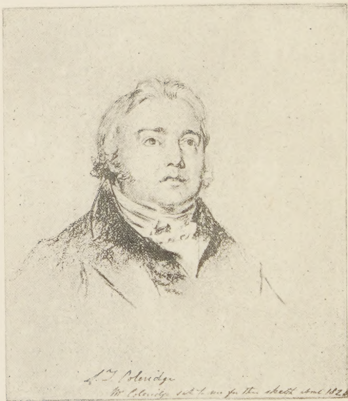
Samuel Taylor Coleridge from a drawing by C. R. Leslie R. A.